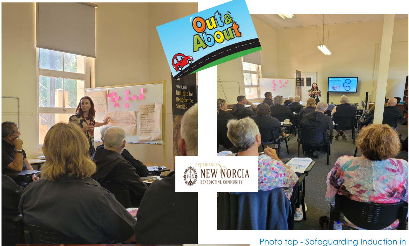
Photo top - Safeguarding Induction in New Norcia Parish